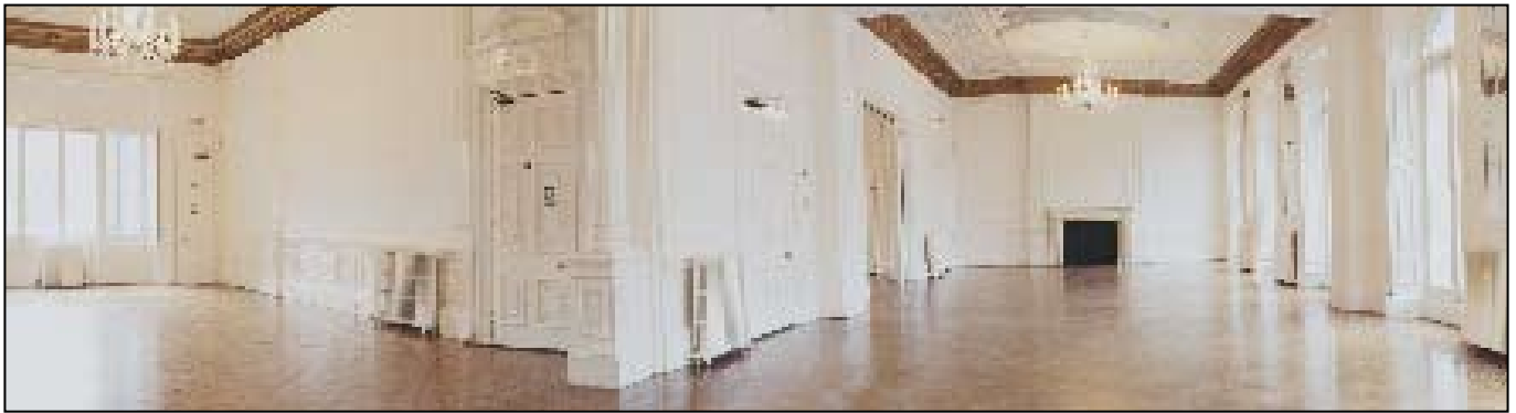
Grand Gallery - 1st Floor 8/9, Grosvenor Place London SW1X7SH

“The Evolution of a man, his progress and financial power, depend upon the condition of his inner being. As a leader, it is neither knowledge nor social standing that can prove your way to success but rather your self-knowledge and integrity the results of an inner creative victory that will make yourself and the entire world free from crisis, external attack or failure. The slightest change in your own being move mountains in the world of events”